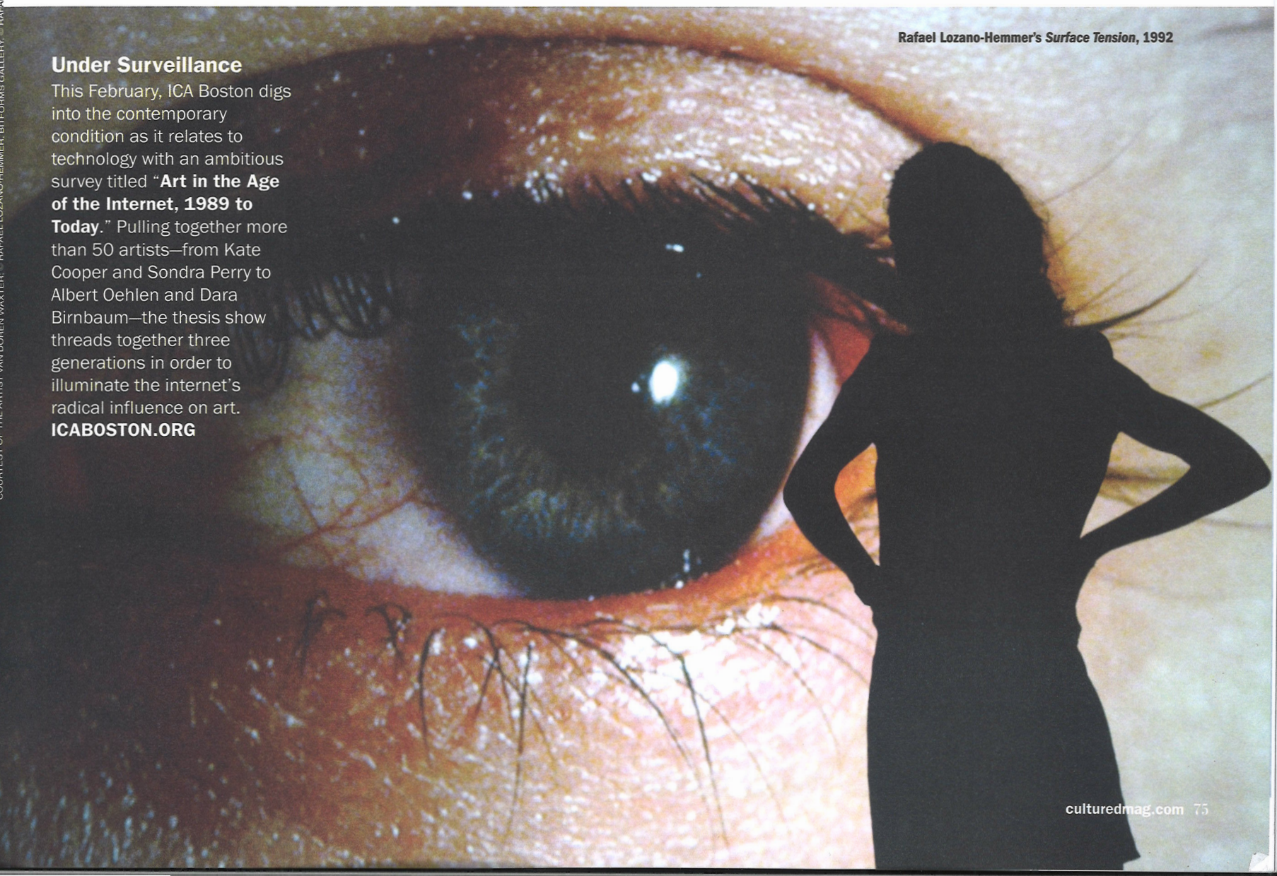
Rafael Lozano-Hemmer's Surface Tension , 1992