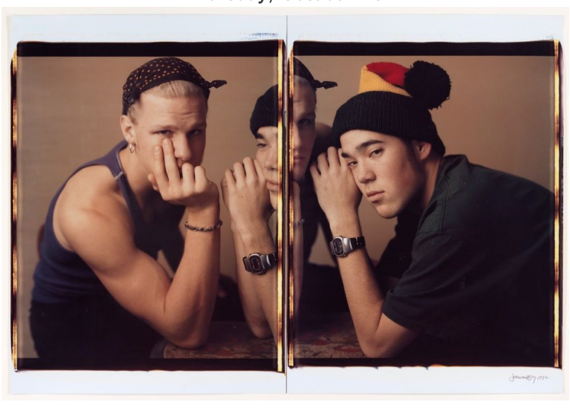
Thursday, October 25