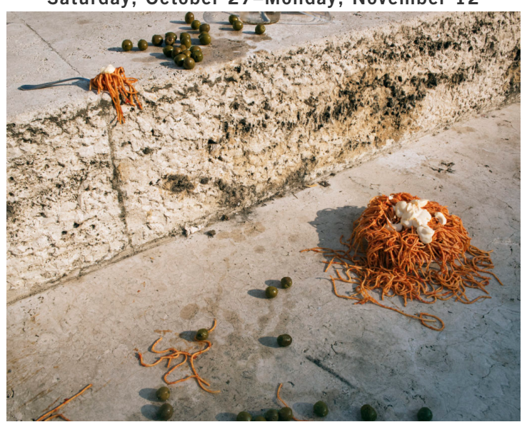
Emma Ressel, Untitled (2016).