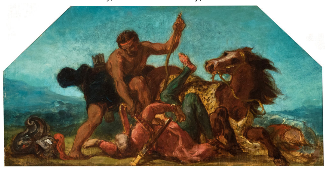
Eugène Delacroix, Hercules and Hippolyte.