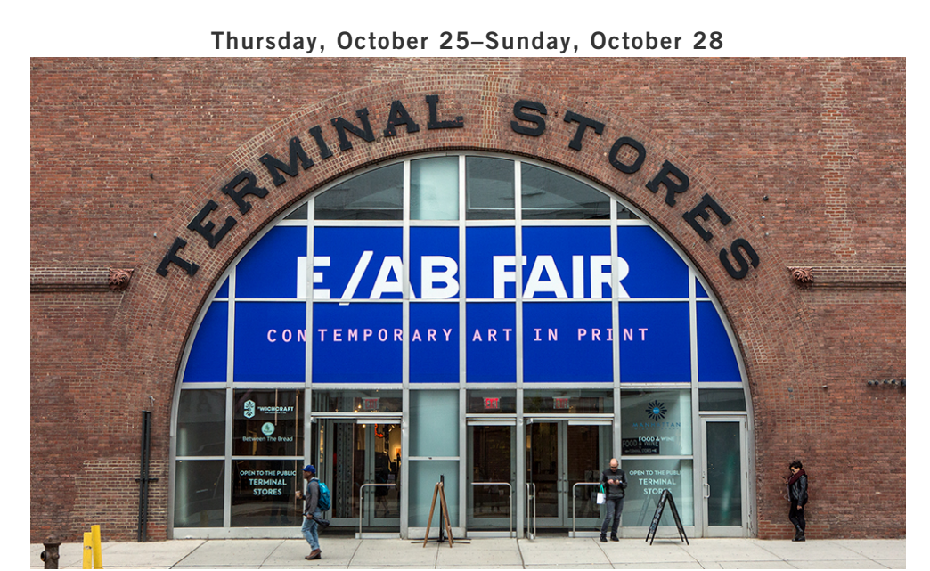
The Editions/Artists' Books Fair.