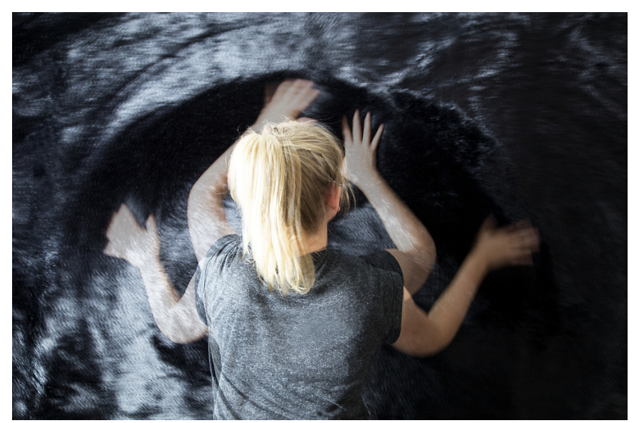
An installation at "The Senses: Design Beyond Vision" at the Cooper Hewitt, Smithsonian Design Museum.