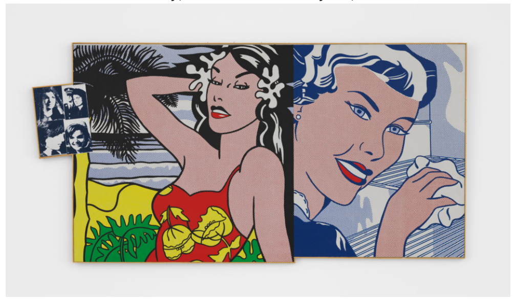
Saturday, October 27-January 19, 2019

Wednesday, 11 a.m.-6 p.m. (VIPs only 11 a.m.-12 p.m.)