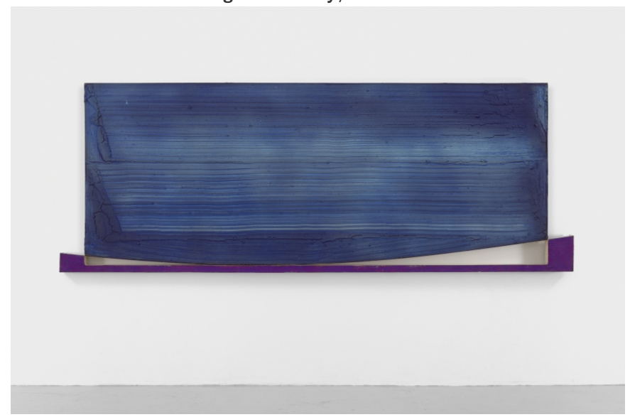
Harvey Quaytman, Mirror to Damascus (1971).