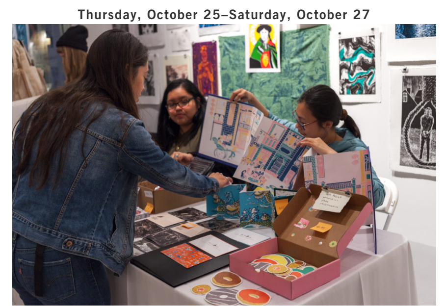
PrintFest by IPCNY. Photo courtesy of the International Print Center New York

Price: $10 Time: 6:30 p.m. —Sarah Cascone