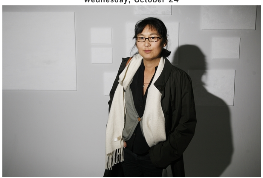
Wednesday, October 24