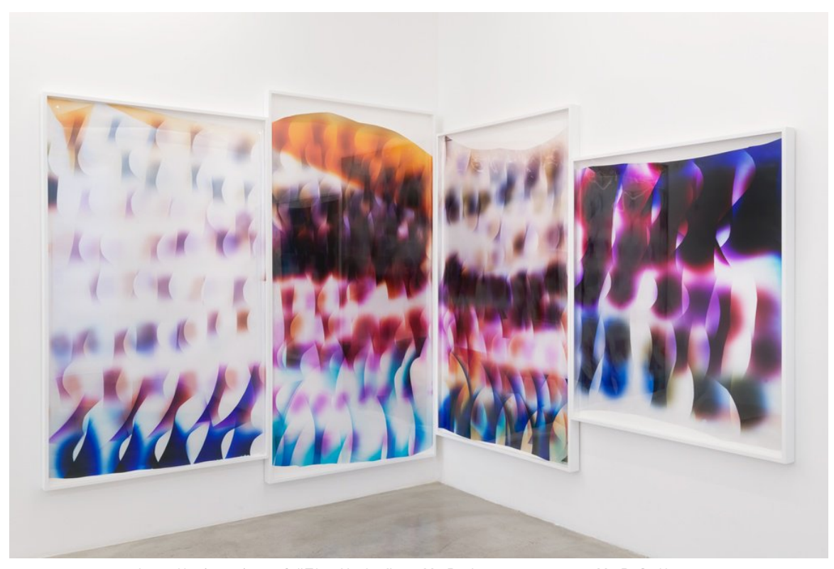
Installation view of "The Hydra" at M+B.