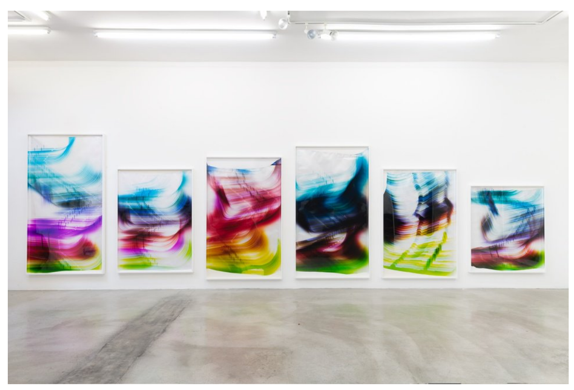
Installation view of "The Hydra" at M+B.