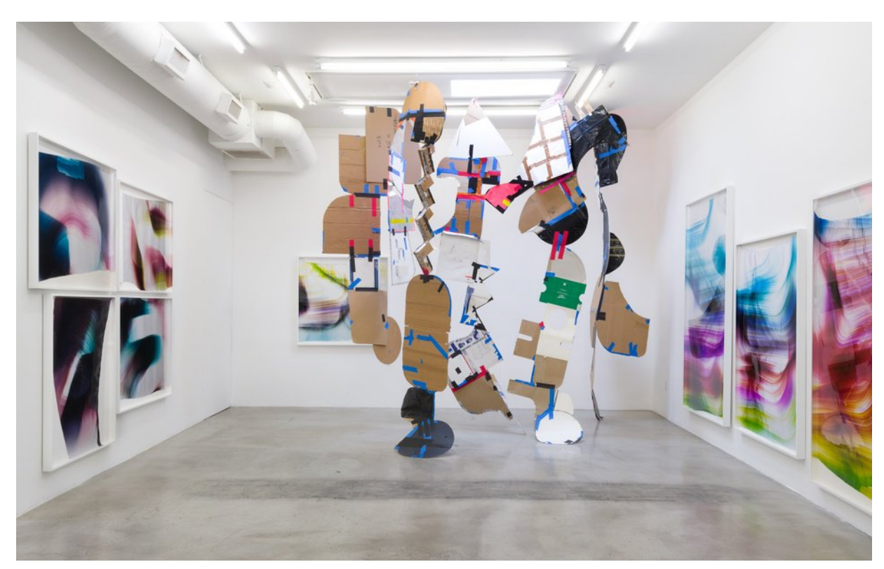
Installation view of "The Hydra" at M+B.