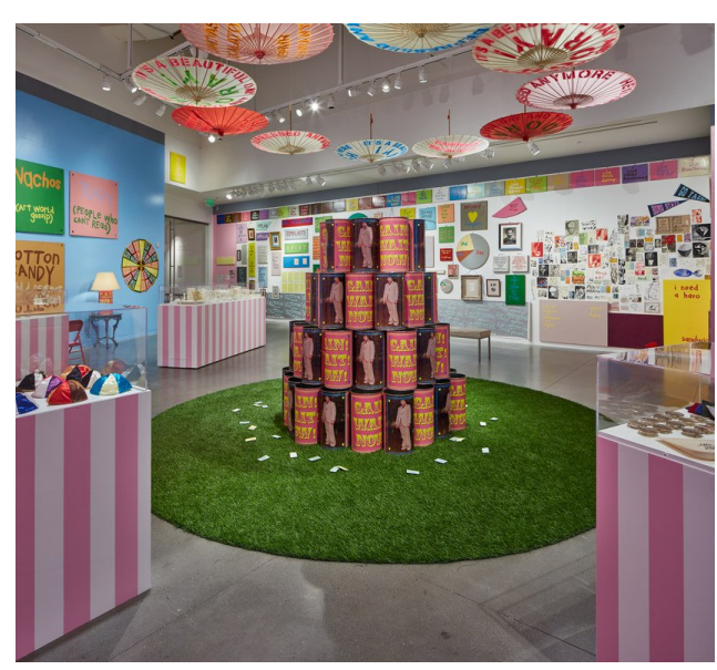
Thursday, March 29-May 13

Installation view of Cary Leibowitz at the Philadelphia Institute of Contemporary Arts.