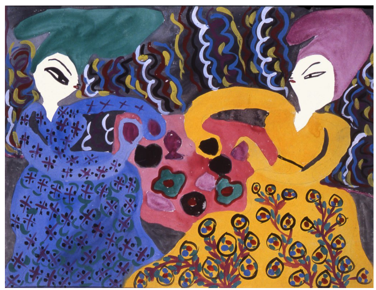
Baya Mahieddine, Femmes attablées (Women at table) , 1947. Courtesy of the Grey Art Gallery, collection of Adrien Maeght, Saint-Paul-de-Vence, France.