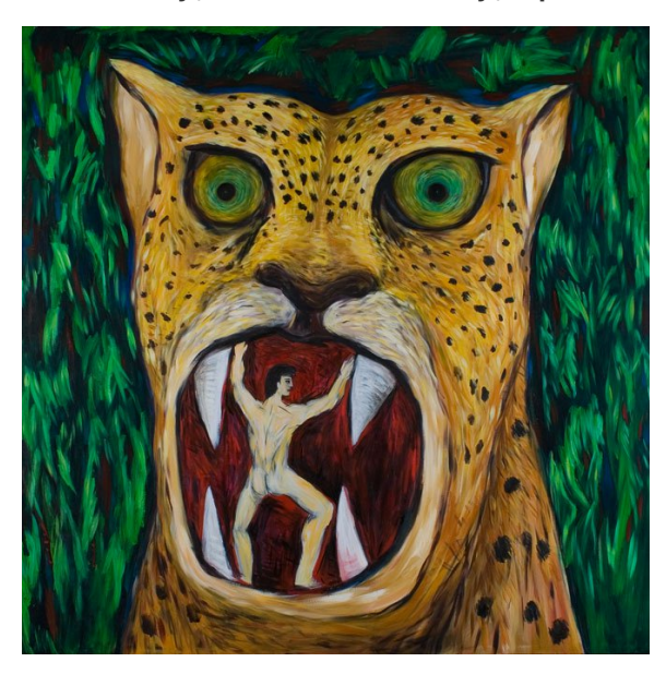
Wednesday, March 28-Sunday, April 15