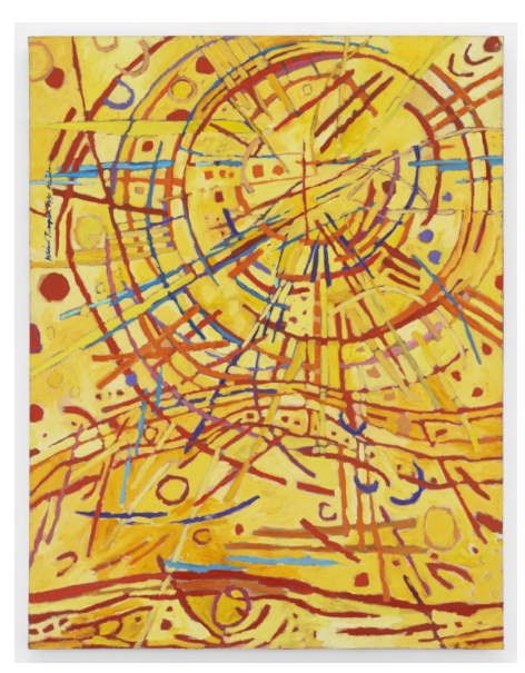
Through Saturday, March 31