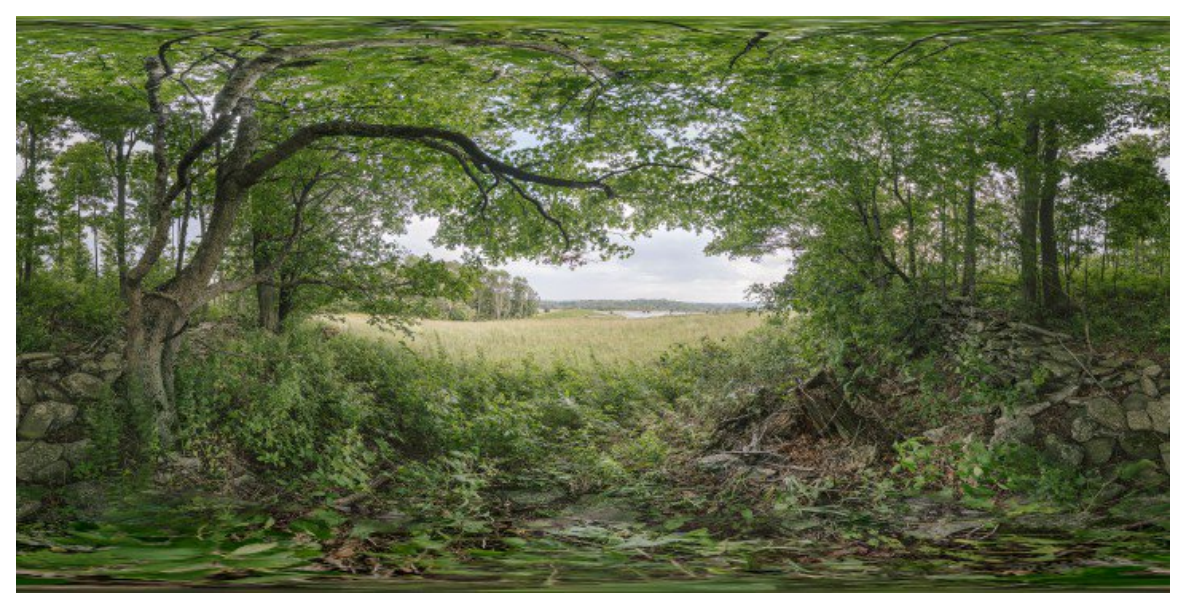
"Sex and the So-Called City," Office for Political Innovation.