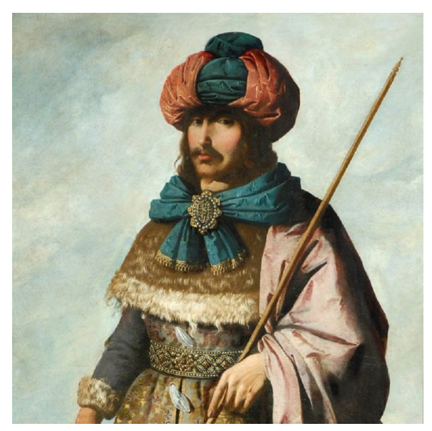
Francisco de Zurbarán, Joseph (1640-45), from the series "Jacob and His 12 Sons."