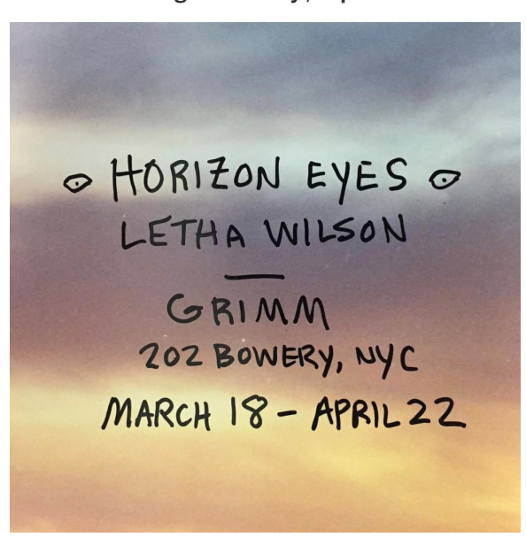
Through Sunday, April 22