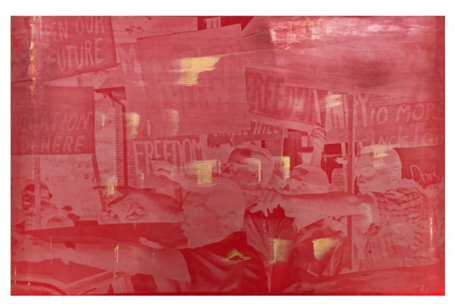
Thursday, March 29-May 12