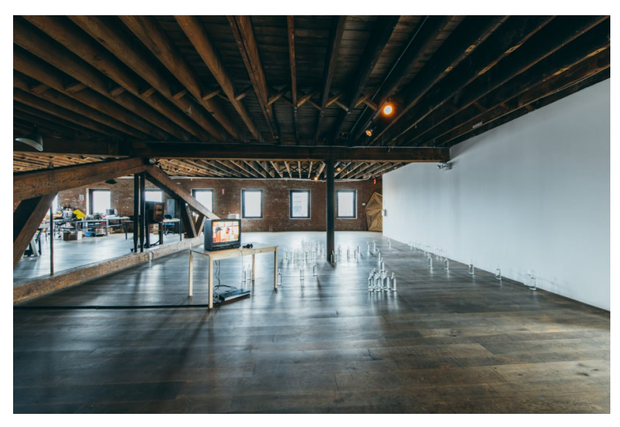
Through Thursday, April 8