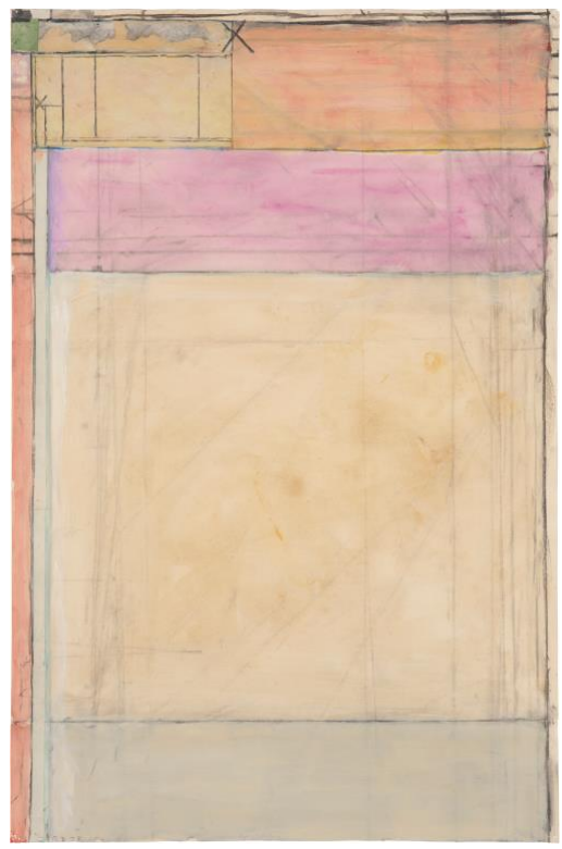
Richard Diebenkorn, Untitled, 1978, Acrylic, charcoal, crayon. and pasted paper on joined paper. An earlier version of the work is visible in the 1978 photo of the Davenport studio above.

Within Davenport's file were three photographs of Roselle's studio, taken during the Diebenkorns' 1978 visit. Before, the foundation had known of just one photo. The new images included six additional Ocean Park works, all of which also appear in photographs of Diebenkorn's studio wall in Santa Monica in 1979. Holman notes that the 1978 works created in Provence employ Ocean Park tropes—an arch, lines painted over in gouache, stripes of color along the upper edge, washy areas of pastel and primary colors varying in density, and the "scaffolding" nature of the lines across the paper. One meaningful revelation was that the painting used to illustrate the cover of the new 2019 Rizzoli monograph, Richard Diebenkorn: A Retrospective , was begun in Roselle's studio in 1978—a fact not known when the work was selected. After scrutinizing the new photographs from Kay Davenport and combing the foundation's database, Holman and her colleagues discovered that Diebenkorn, after returning from France, reworked the upper section of the drawing entirely (painting over, for instance, a blue triangle and introducing a series of horizontal and vertical charcoal marks). The photographs suggest that, contrary to what had previously been assumed, "wherever he was, Ocean Park existed," said Holman.