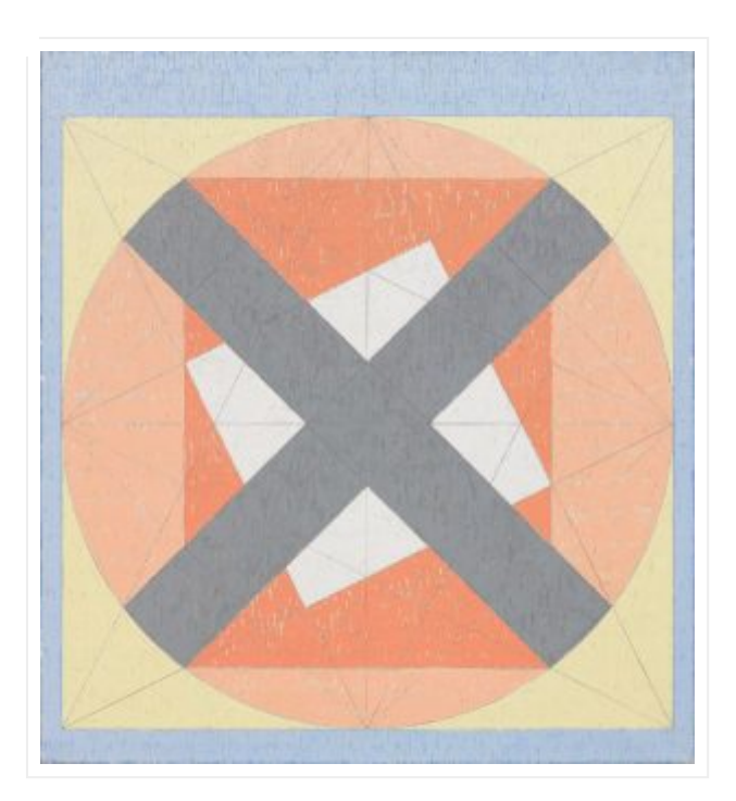
Jack Tworkov, X on Circle in the Square (Q4-81 #2), 1981, acrylic on canvas, 49 x 45 in.; Courtesy Alexander Gray Associates, New York © Estate of Jack Tworkov / Licensed by VAGA, New York, NY

"The New American Painting" advanced an ambitious hypothesis: the Abstract Expressionists now formed the modernist vanguard. Convinced that they were no less significant than Impressionists or Cubists, the painters themselves had come to this conclusion a decade earlier. No longer American provincials, they had merged personal ambition with historical destiny.